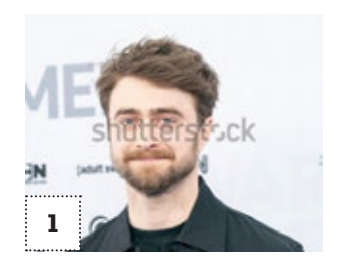
(likes the game and players)