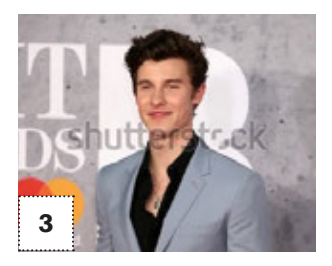
(started as a teenager)